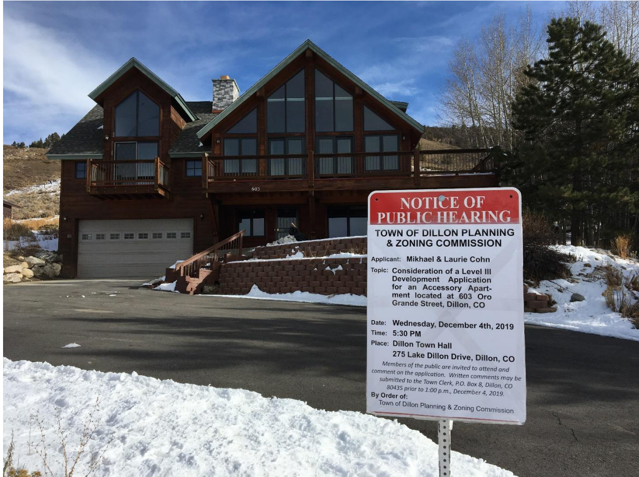
Site Posting November 25, 2019 - 603 Oro Grande Street, Dillon

The Town posted a sign of the Public Hearing on the site on Monday, November 25 th , 2019. A newspaper ad ran in the Summit Daily (Journal) on Friday, November 22 nd , 2019, and a mailing noticing the public hearing time and date was sent out on Thursday, November 21 st , 2019 to property owners within 300 feet of the site. The notices were made within the required 7-day minimum and 14-day maximum notice period required by the Dillon Municipal Code (the “Code”).