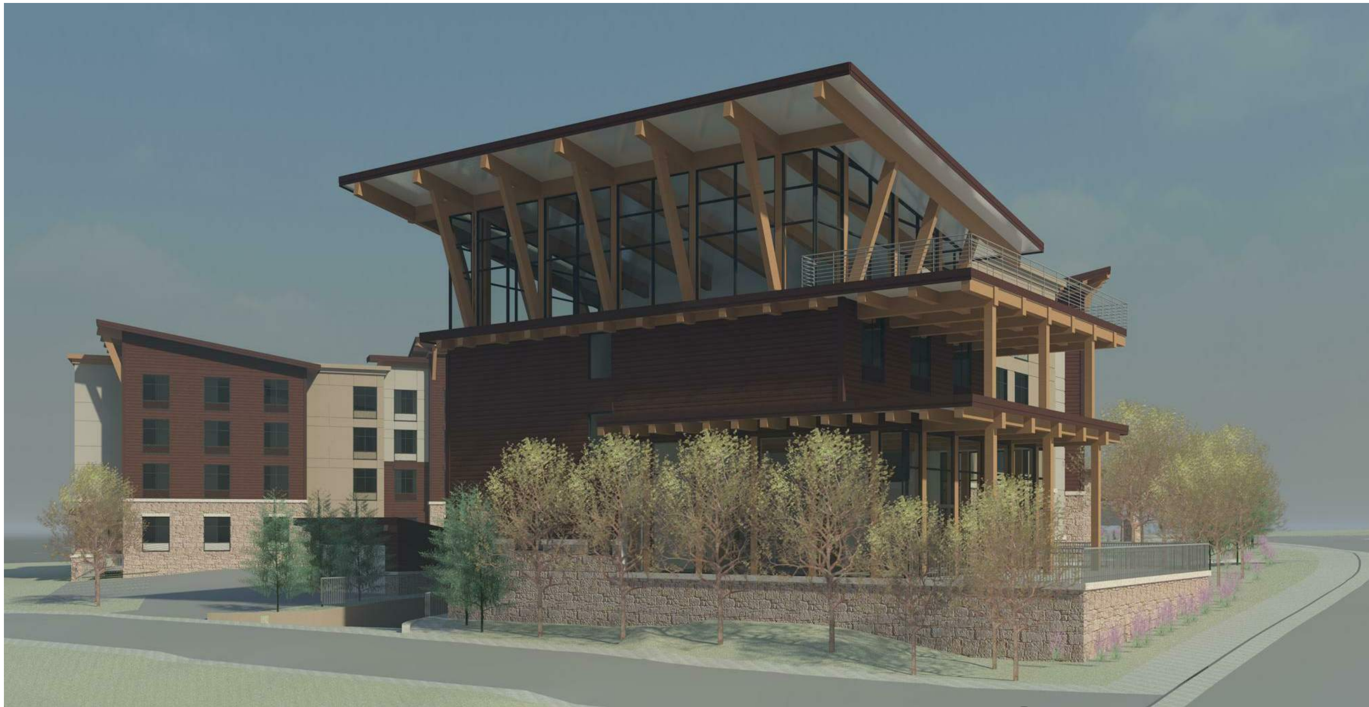
1 RESTAURANT VIEW A12.5