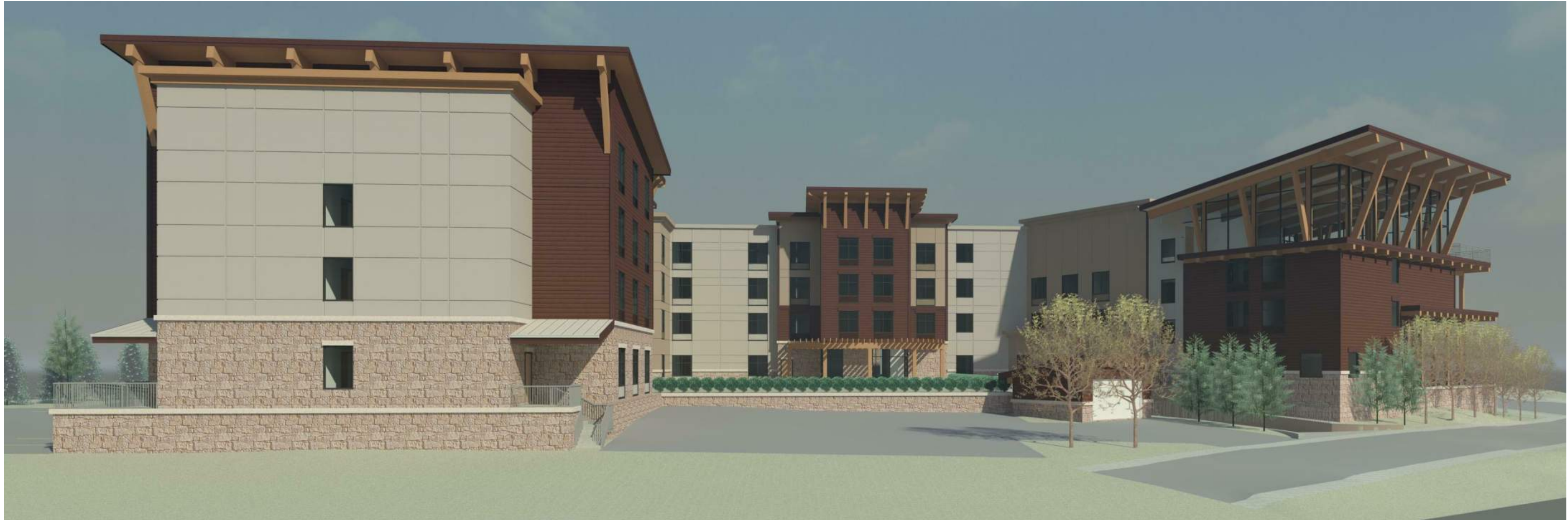
1 SOUTH SIDE VIEW A12.8