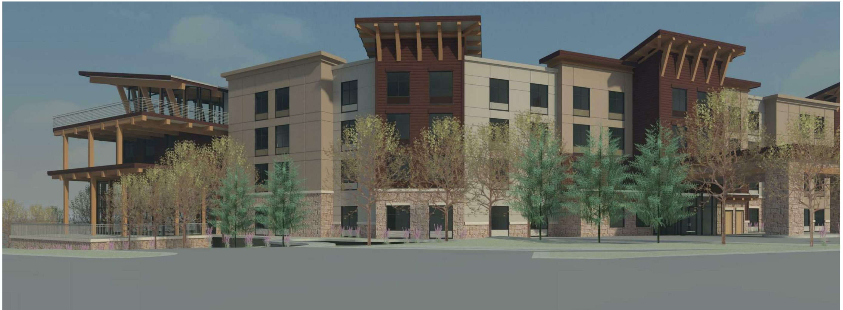
1 EAST SIDE VIEW A12.2