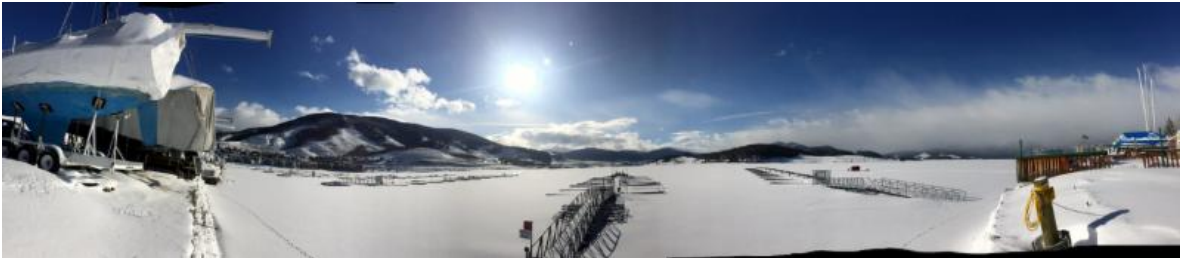
(This morning's sunrise at the marina)